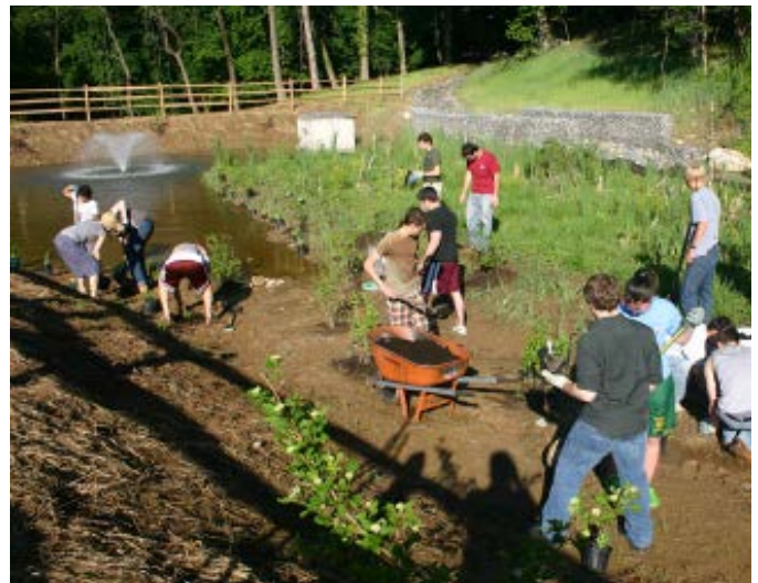
Planting day, spring 2010.