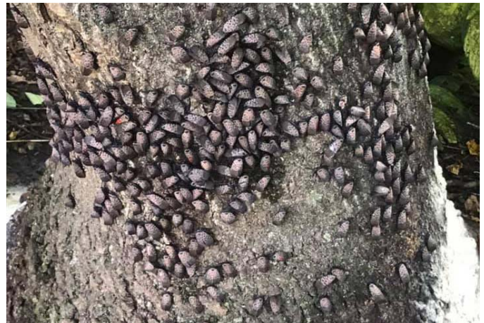
Spotted Lanternflies cover the base of this tree.

To learn more about sinkholes: https://www.dcnr.pa.gov/Geology/GeologicHazards/Sinkholes/Pages/default.aspx