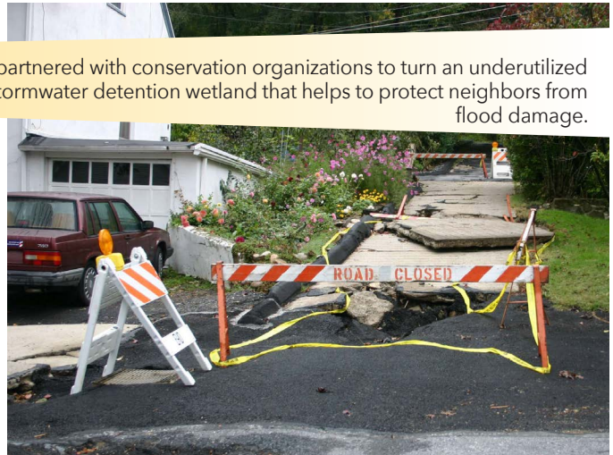
Damage from Hurricane Ivan, fall 2004.