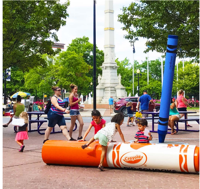
Easton residents enjoying a public space in the city's center square.

Residents now enjoy walking along the D&L Trail and exploring the Delaware and Lehigh National Heritage Corridor in this area, as well as riding on a mule-drawn canal boat at the National Canal Museum in Hugh Moore Park. Other favorite sites for spending time outdoors include the Karl Stirner Arts Trail along the Bushkill Creek, the Two