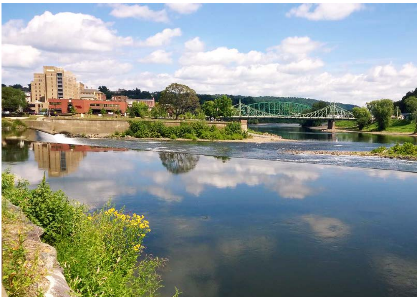
"Easton where the Lehigh meets the Delaware" by yumievrwan is licensed under CC BY-NC-ND 2.0

local officials and residents, Nurture Nature Center has identified that priority hazards in the area include riverine flooding, flash flooding, winter storms, and extreme temperatures. While these hazards are most significant across the region as a whole, other hazards including radon, sinkholes, and invasive species also affect the community, so this guidebook provides information on them as well.