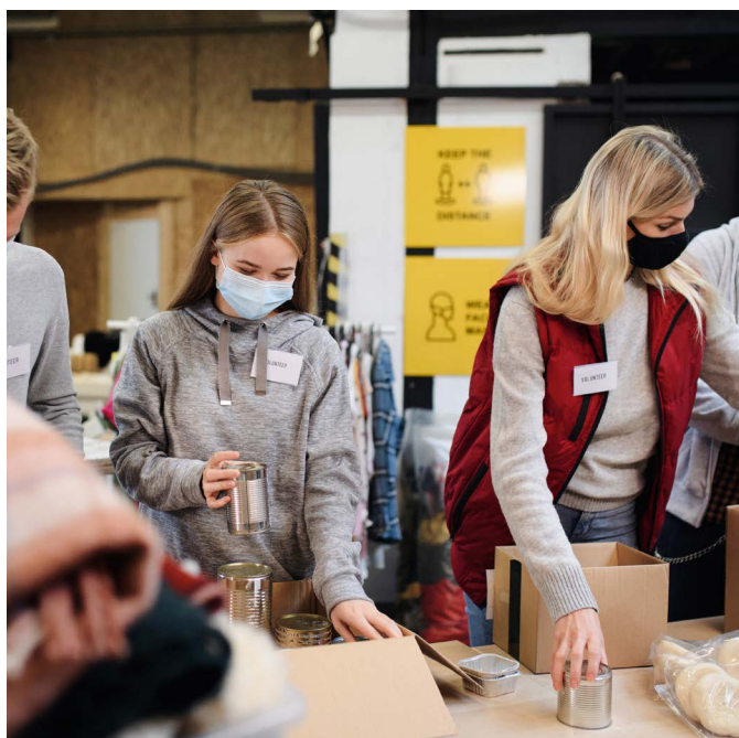
Volunteers at a community center prepare boxes of food for those in need.

In addition to formal community mitigation efforts, there are many informal ways of collaborating with your neighbors to make everyone safer in the event of a natural hazard event. Ties to the people around us and to community organizations that can provide help are some of the most valuable resources during an emergency. In preparation for a potential urgent situation in the future, you can start fostering relationships with people in your community, getting to know if elderly people or other vulnerable individuals live nearby and checking on them. You can also begin discussing with others what would make your community more resilient and taking those steps with the help of local organizations or government bodies as needed.