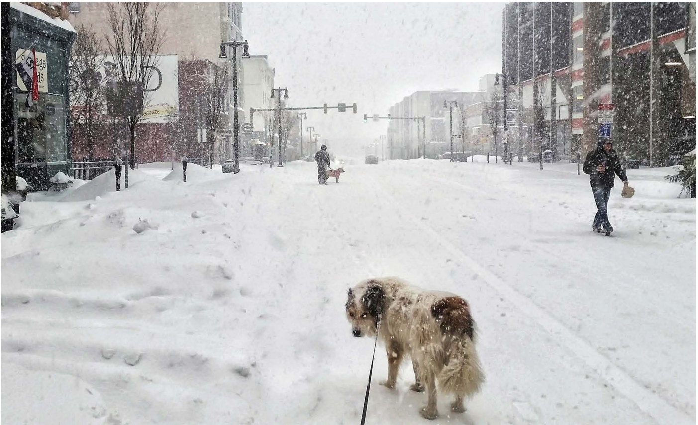
View of South Third Street, looking south.

As Superintendent of both the Bangor and Easton Area School Districts for 20 years, John Reinhart was responsible for closure determinations due to a variety of hazards, including winter storms. The process for making such closure determinations starts with watching storms until 24 hours in advance of arrival, and talking with fire, police, public works, or other superintendents from nearby districts. Weather, especially in winter, can be unpredictable, so schools must be prepared to modify routines to handle hazards. The school has its own salt and snowplow supply for storms up to six inches but after that, municipalities help in clearing the properties, highlighting the importance of maintaining working relationships.