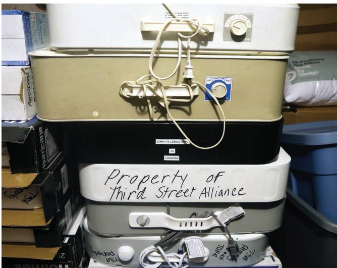
Fans stacked up and ready for the heat.

Both extreme heat (temperatures 10 degrees or more above average that persist for several days or weeks) and extreme cold (temperatures below freezing for an extended period of time) can result in serious illness or even death due to rapid increase or decrease in body temperature. Extreme cold can cause hypothermia, a life-threatening condition. Hypothermia can even occur at temperatures as warm as 40 degrees in windy conditions or if a person becomes damp from precipitation or sweat. Heat-related illnesses are a leading cause of death from weather-related hazards. Heat exhaustion and heat stroke, often caused by the combination of heat and humidity, are very dangerous conditions, and children, the elderly, and people with preexisting conditions are at an elevated risk. In urban areas with minimal vegetation, hot weather can be made worse by the “urban heat island effect,” where the prevalence of concrete and asphalt raises temperatures above that of surrounding areas. Heat effects can accumulate within the body, so heat waves are especially dangerous when it does not cool off at night and people’s homes remain above 70 degrees for an extended period of time. As a result of climate change, these conditions are expected to become more frequent in this region, increasing the importance of preparing for extreme temperatures.